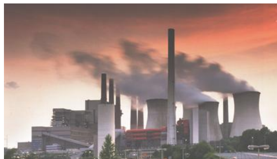
Figure2. Thermal Power Station

In XX-XXI centuries flaring of gas, liquid, pulverized fuel in furnaces, fire boxes, combustion chambers was widespread. For example, a steam boiler box of 300 MW unit is a rectangular parallelepiped of 14 m width x 7 m depth x 35 m height. When working on fuel oil, the furnace burns 67 tons of fuel every hour (Figure 2). High temperature radiating gas volume is formed in the furnace and fills it. All of 10^{30} - 10^{45} atoms radiate in the torch. The radiation of each atom to the calculated area is to be considered.