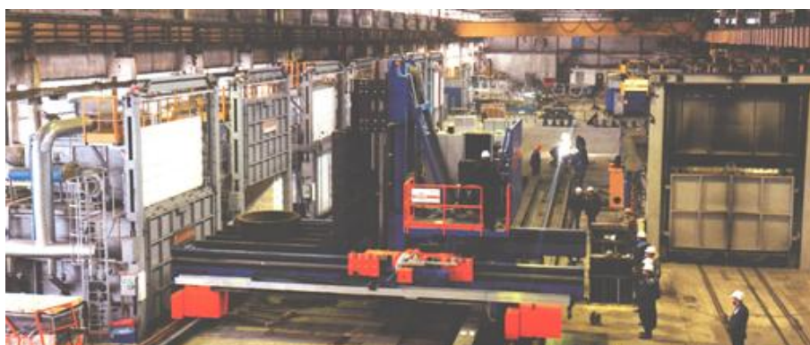
Figure3. Heating furnace

The calculations of heat transfer by radiation in torch furnaces (Figure 3), fire boxes, combustion chambers were carried out by zonal and numerical methods in the twentieth century. In zonal and numerical methods, the furnace is divided into 1–1,5 million cells, the radiation from gas volume of the torch is modeled by the radiation from the surfaces of these cells. In case of surface and volume zones, we use numerical discrete approximations of radiation heat transfer integral equations for calculating radiation fluxes and zone temperatures on the computer. These methods use the large number of approximate temperatures and optical coefficients of zones and the law of heat radiation from blackbody, the Stefan-Boltzmann law (1). However, the radiation from gas volumes of torches is not subject to the Stefan-Boltzmann radiation law and the calculation of combustion products error accounts for 70-90% or more [5-8].