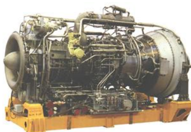
Figure5. Gas turbine plant

On the basis of the disclosed laws of heat radiation from cylindrical gas volumes, a new concept of calculating heat transfer in electric arc and torch furnaces, fire boxes, combustion chambers of gas turbine plants developed (Figure 5). According to the new concept, dozens of calculations of heat transfer in electric arc and torch furnaces, fire boxes, combustion chambers were performed, which results are presented in [5-17]. Experimental studies have confirmed that the error of such calculations does not exceed 10%. This new concept of calculation of heat transfer in electric arc and torch furnaces, fire boxes, combustion chambers is confirmed by experimental studies and approved by the Educational and Methodical Association for education in the field of metallurgy of the Ministry of education of the Russian Federation as a textbook and is used for training students and postgraduates. Laws of heat radiation from gas volumes (2) – (6) combined with the laws of heat radiation from blackbody (1) entered into the textbook [5].